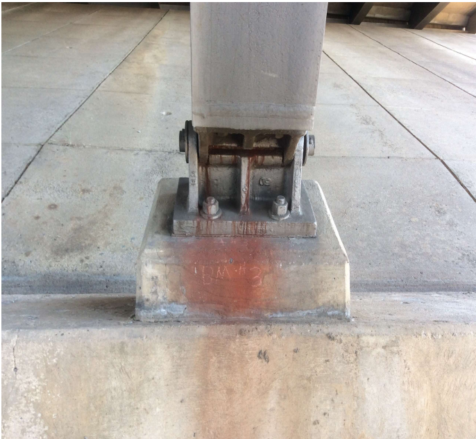
PHOTO 1 Description Bent 3. Column 3. Fretting