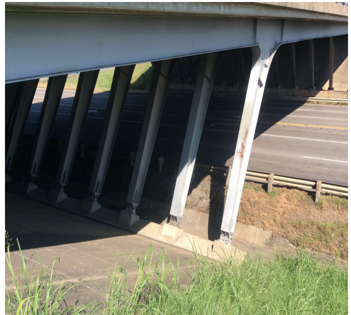
PHOTO 5 Description Bent 2, Beam 6. Corrosion.