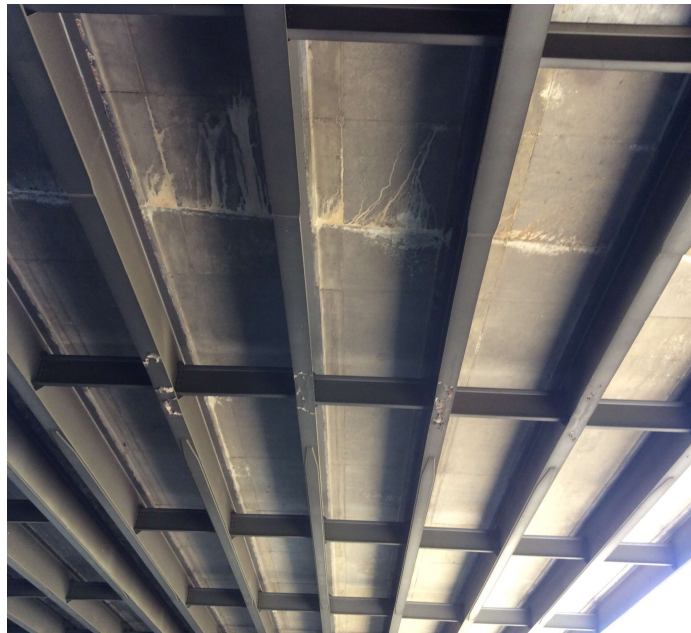
PHOTO 3 Description Span 2 Deck soffit over Eastbound lanes.