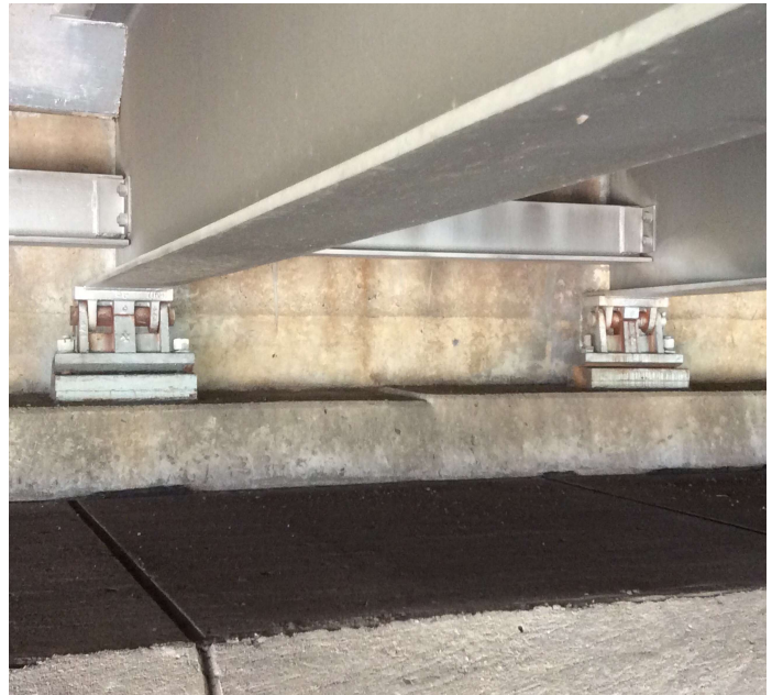
PHOTO 2 Description Bent 1. Bearings at beams 3 & 3. Fretting.