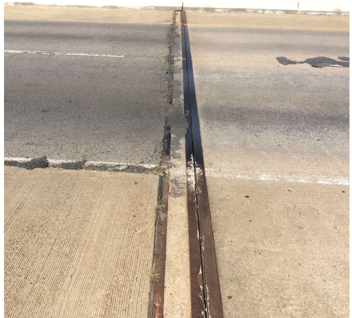
PHOTO 2 Description Bent 1. Expansion joint