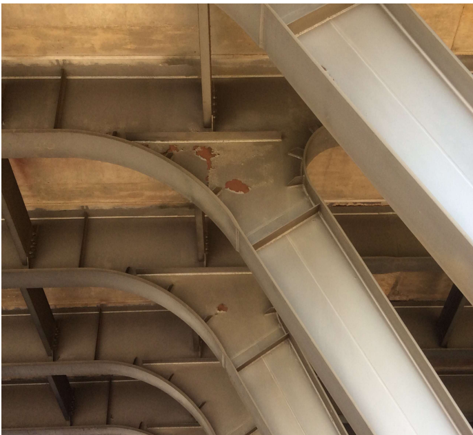
PHOTO 1 Description Bent 3. Column 3 & 4. Paint peeling.