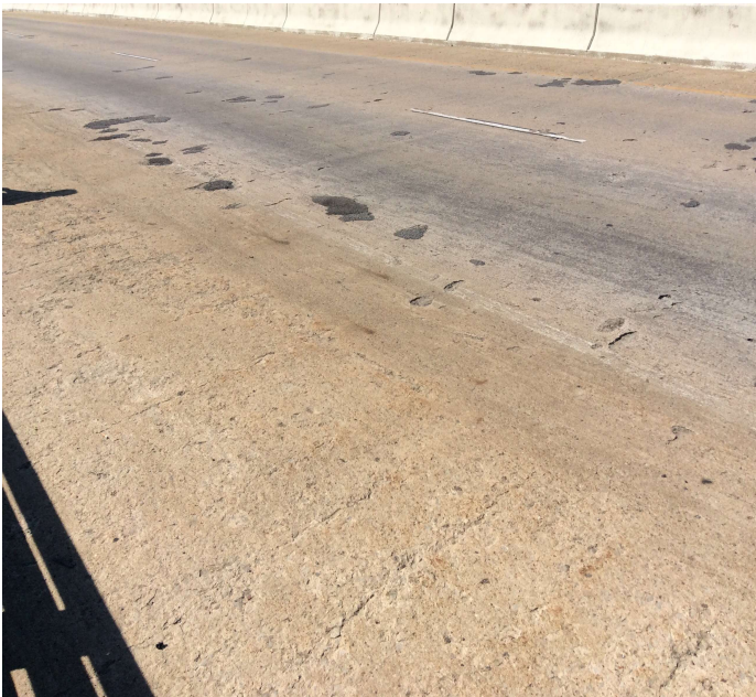
PHOTO 4 Description Span 3. Typical