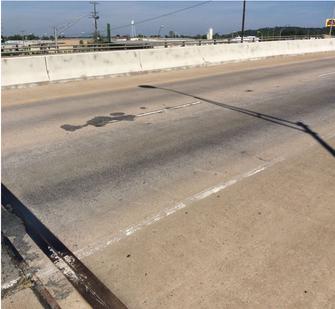
PHOTO 3 Description Span 1. Typical