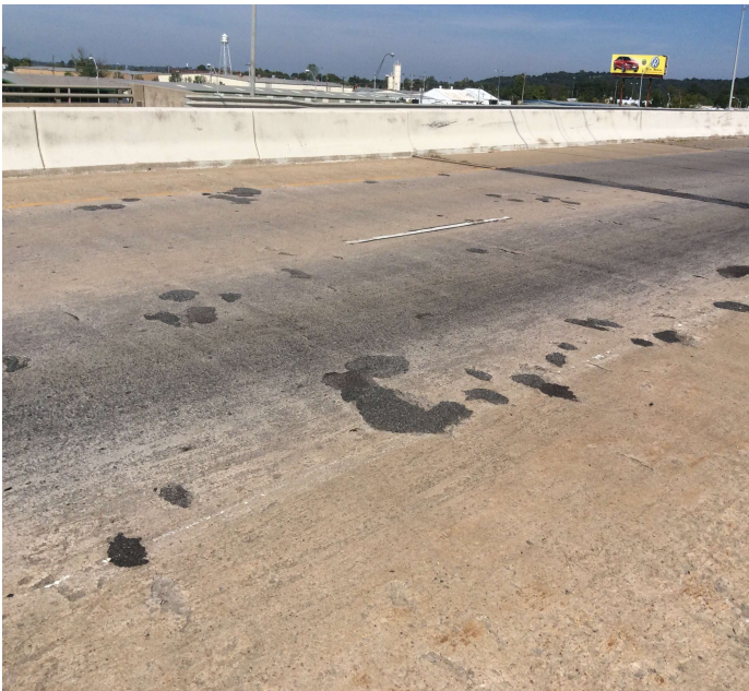
PHOTO 1 Description Span 3.