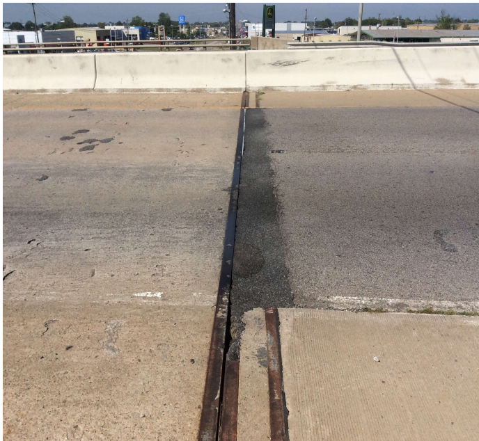
PHOTO 1 Description Bent 4. Expansion joint