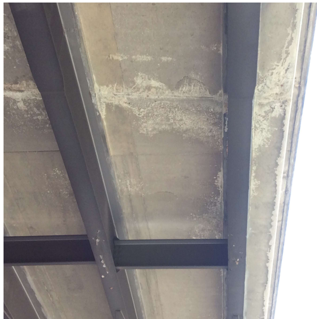
PHOTO 4 Description Delaminated areas over Eastbound lanes.